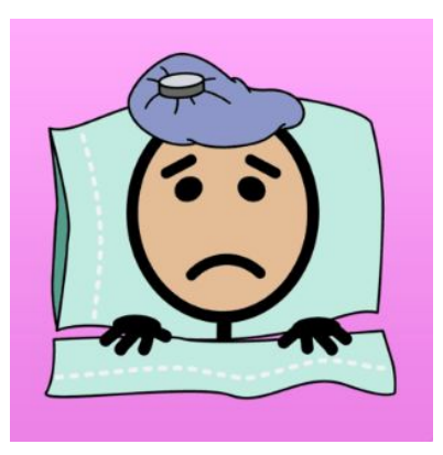
Corona Virus has been making people sick