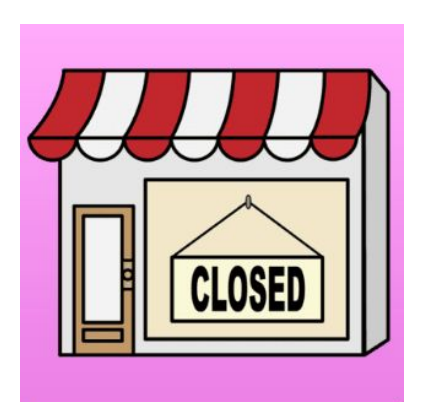
So, schools, stores and offices will remain closed for 3 more weeks