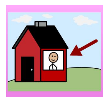
We will stay indoors for few more weeks