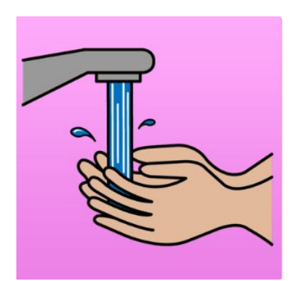
We will wash our hands regularly