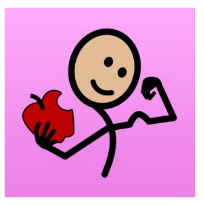
We will stay healthy and keep the Coronavirus away