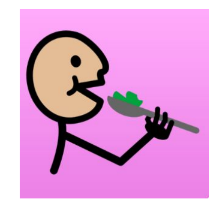
We will eat healthy and exercise regularly