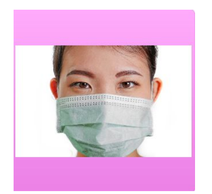
We will wear mask while going for walk outdoors and stay 6 ft away from others