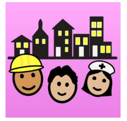
We too can help the doctors and healthcare professionals